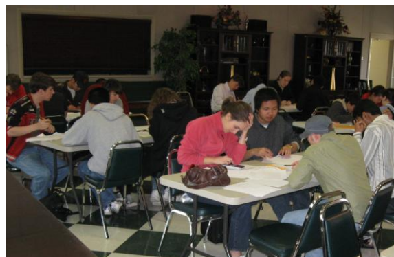
The student teams were hard at work during the student team competition on Friday morning.