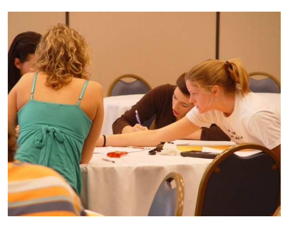
Team work was important in getting the problems worked during the competition.