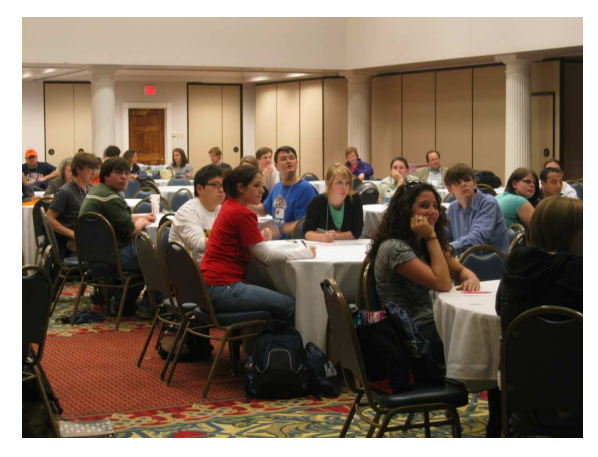
The Integration Bee